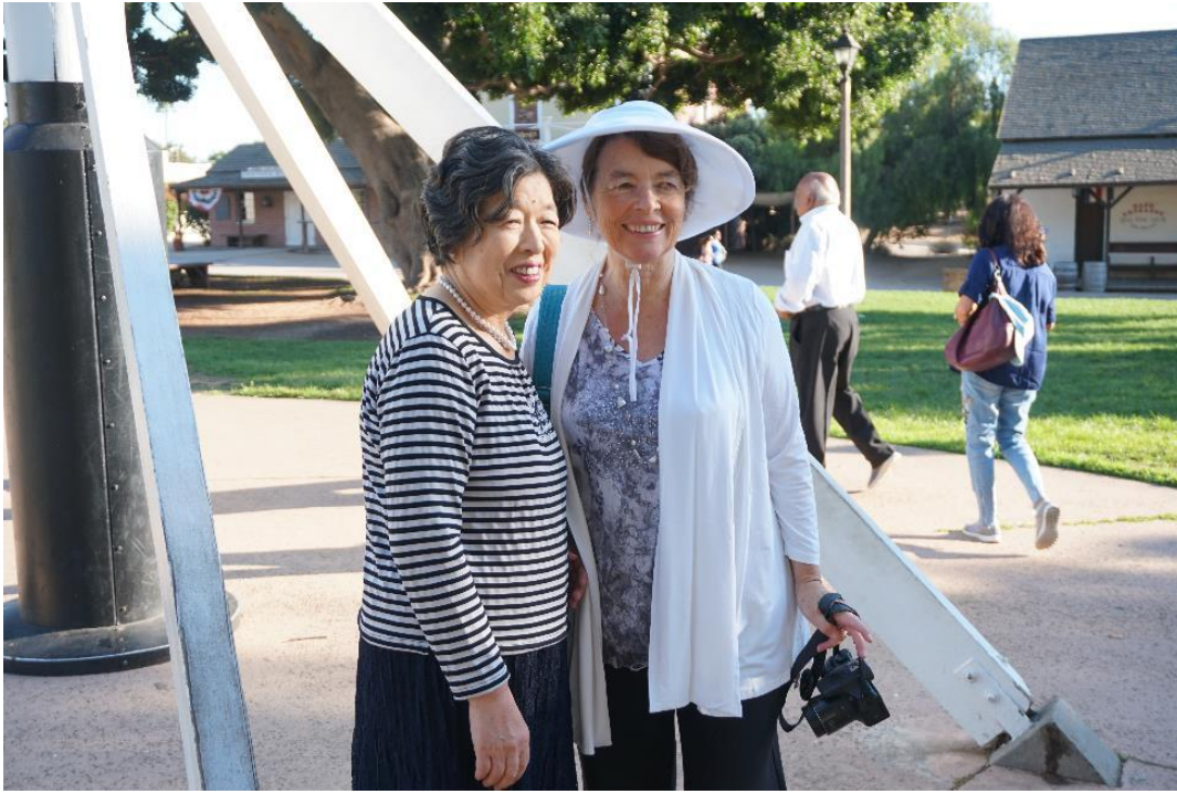
We had time before dinner to stroll around Old Town, the first settlement in San Diego, now a State Park with period shops and restaurants.