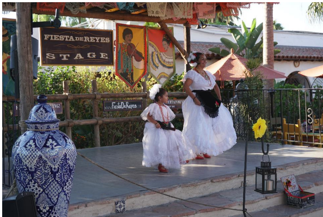
Old town features traditional music and dance.