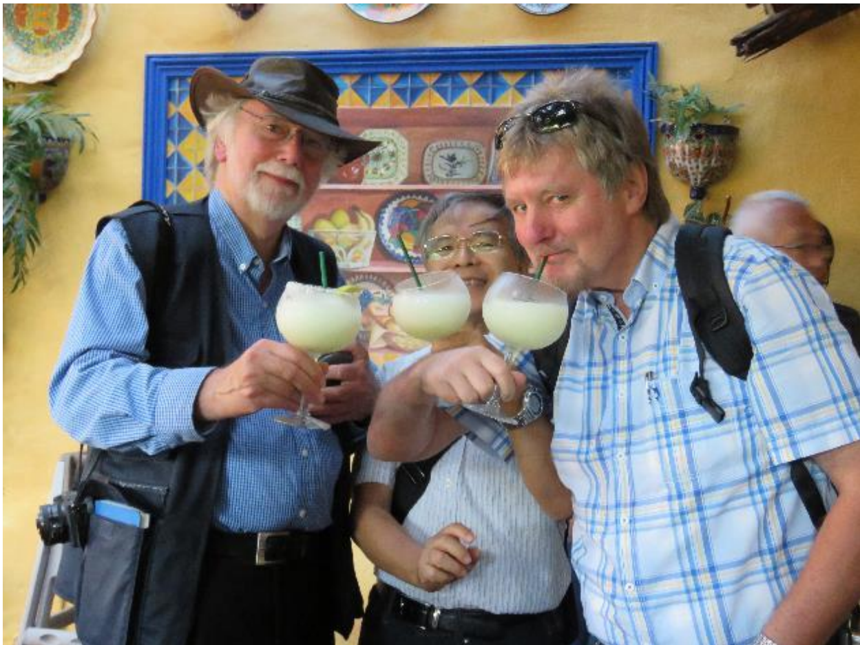
Places for fun photog raphs ..... ..... .....an d margar itas before dinner.